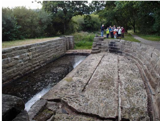
Visit to The Graving Lock at Stover Canal

Membership Subscriptions: Single £6: Joint £10* * Two people living at the same address All enquiries to:- cadass.tq13@gmail.com